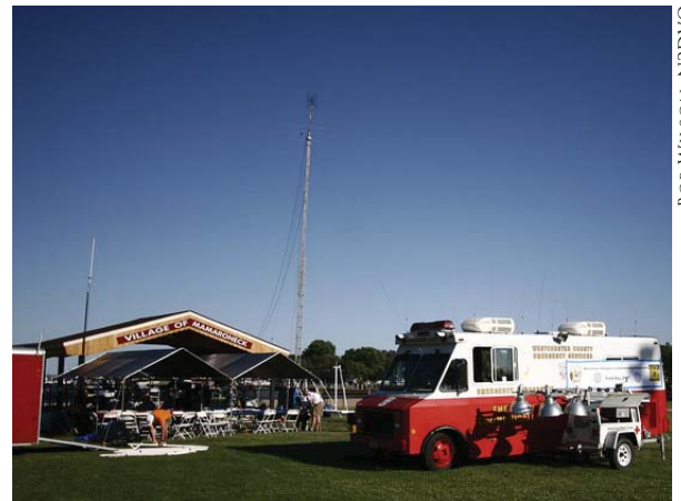
BOB WILSON, N2DVC

This year WECA will operate 4A or four alpha. That means that we will be using a generator to provide power continued on page 2