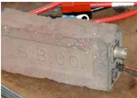
Solid State Brick

This is the time of the year that we realize why we are "Ham Radio Operators" Because we can take advantage of our hobby while sitting in a nice warm room