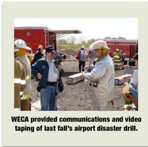
WECA provided communications and video taping of last fall's airport disaster drill.

We sent an email to all members on Saturday night explaining the sign up process. By Monday, 25 members signed up for the tour and we have another seven on the wait list!