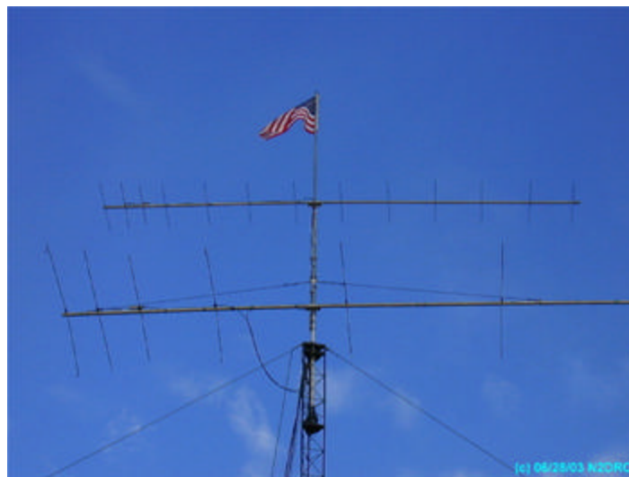
N2DRO, Field Day '03