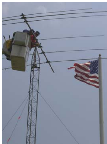
Mounting Antennas at Field Day 2002

Help! They need some hams! Not just any hams, but us! Please participate in at least one public service event in 2003!